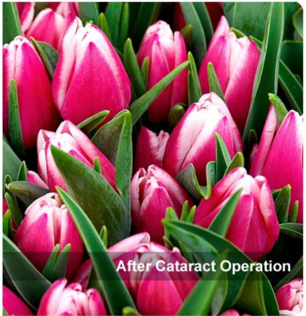
After Cataract Operation